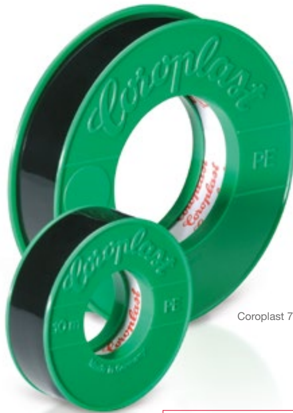
Coroplast 701 PE

Electrical insulating tapes based on elastomer-modified PP