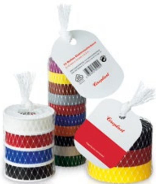
Coroplast net bags