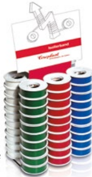
Coroplast 1000, 1010