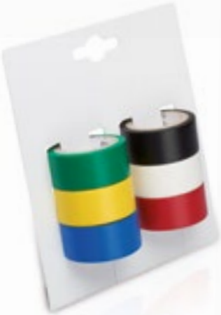
Sample single-material 6-pack