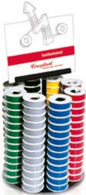
Coroplast revolving display stand 301, 302