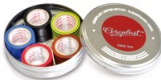
Coroplast round can, 20 m and 50 m