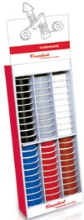
Coroplast 2000, 2010