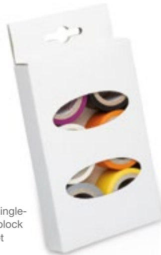
Sample single-material pack of insulating tape