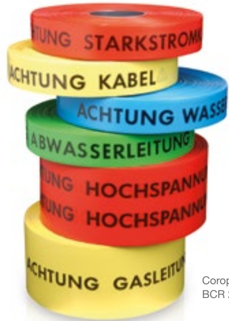
Coroplast BCR 26