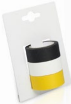
Sample single-material 3-pack