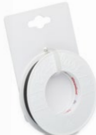
Sample single-material 1-pack