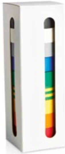
Sample single-material block combi-set