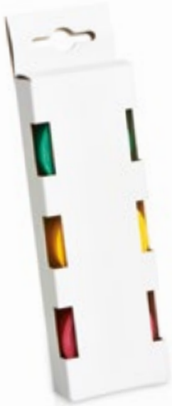
Sample single-material pack of textile adhesive tape