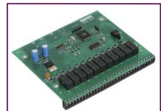
Sigma CP Ancillary Board - K580