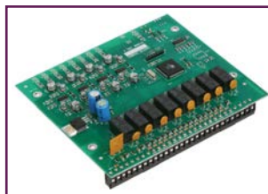
Sigma CP Sounder Board - K461